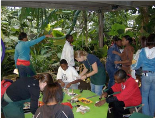
Green Teens volunteering in the Children's Garden

The Green Teen program is a 10-week job-readiness program for teenagers who will create natural and green-inspired products to be sold in the Garfield Park Conservatory Gift Store. Learn resume writing, basic business management, career exploration, public speaking, teamwork, and individual responsibility. Receive a financial award of $225 at the end of every five weeks for perfect attendance.