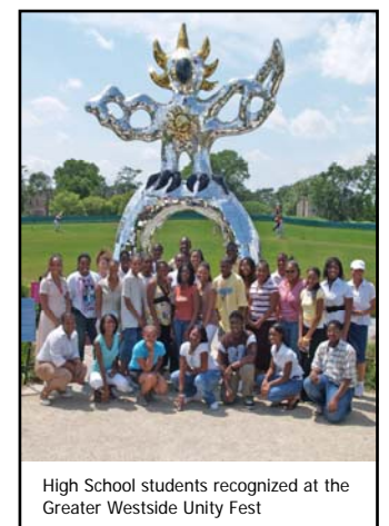
High School students recognized at the Greater Westside Unity Fest