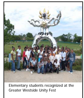
Elementary students recognized at the Greater Westside Unity Fest