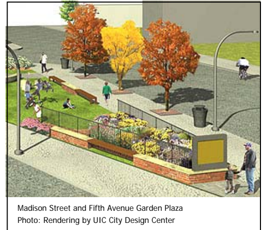
Madison Street and Fifth Avenue Garden Plaza